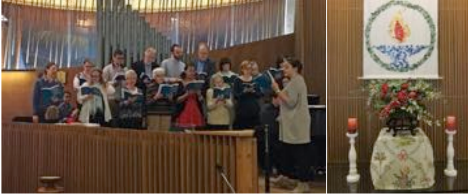
Photo of the choir rehearsing

RE News You Can Use! This Sunday, October 30, the nursery will be available from 10:15-11:45AM for the worship service.