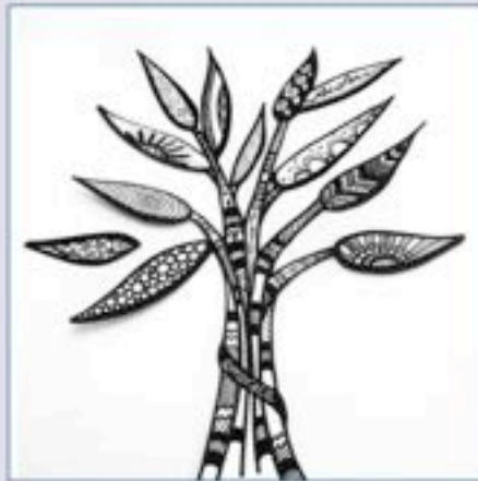
Tree of Life artwork

Join us for ZENTANGLE fun and deepening connections! Learn how to draw Zentangle patterns in the shape of a tree, and then add your positive intentions and favorite colors! The “Wisdom Tree” holds much meaning. We’ll focus on the symbolism of rebirth and a fresh start on life, positive energy, good health and a bright future as well as the symbolism of your growth into a beautiful and unique person who has weathered hardships and who has broad experiences in life, which have made you who you are! You’ll receive guided instruction for drawing a tree, creating tangle patterns and techniques for applying colors, textures and power words. Recharge your battery, manifest positive changes and celebrate awesome you!