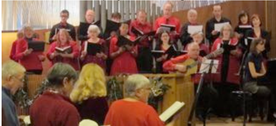
A Glorious Special Music Sunday