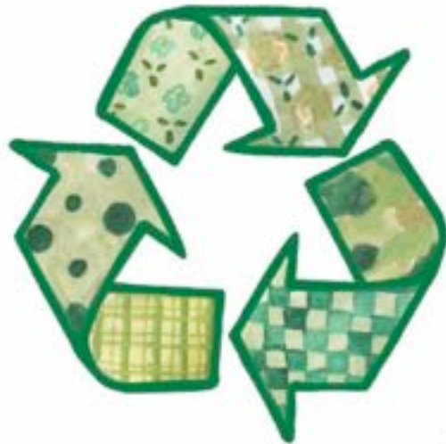
(Unitarian Society of New Haven, Hamden, CT)