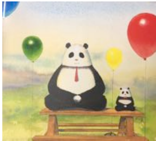
Image: Zen Ties by Jon Muth