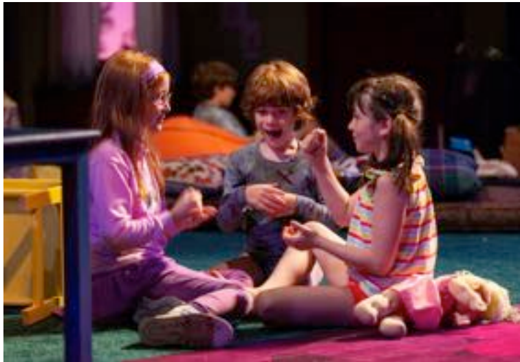
Image: Photo by T. Charles Erickson; hartfordstage.org/make-believe/

Worship Service: Sunday, September 23, 2018 10:30am