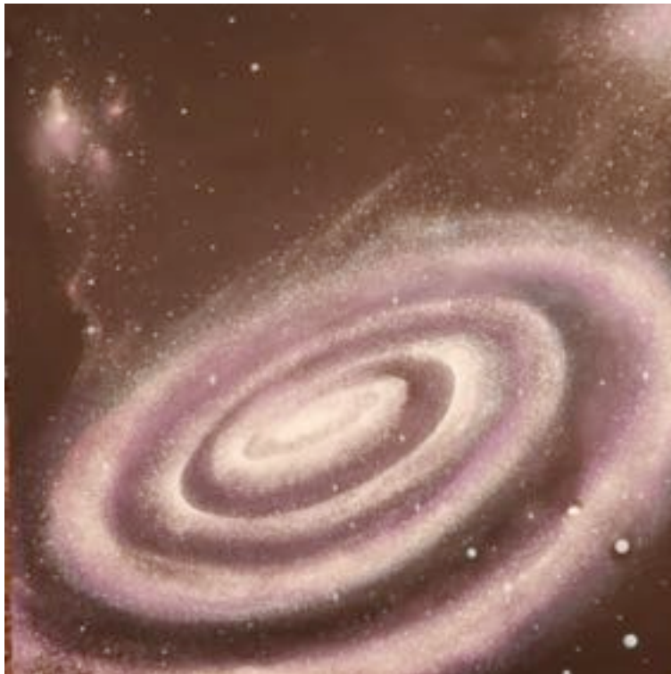
Artwork from Regifting Sale 2019